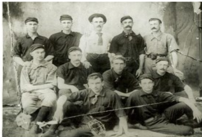
Emporia Browns, 1895.

Join us for the home opener as the Americus team takes on the Emporia Nine in a friendly gentlemen's (and women's) match of 1860s rules, vintage baseball!