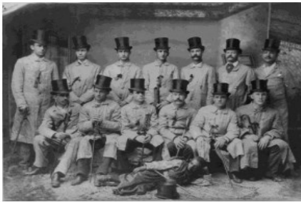
Emporia Baseball Team, 1894.