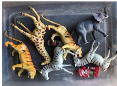
LOT 13: Toy animals.