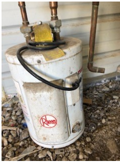
LOT 2: Hot Water Heater 2.5 gallon