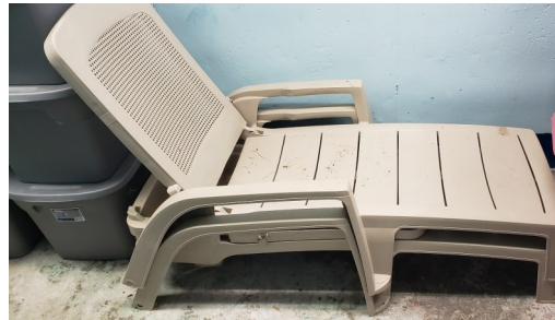
LOT 18: 2 Lounger chairs