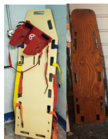
LOT 8: 2 back boards