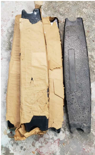
LOT 17: 4 Ladder steps