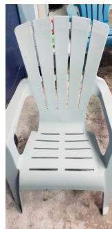
LOT 24: 2 Grey Chairs