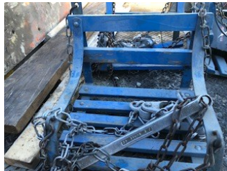
LOT 19: Swing