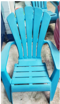
LOT 22: 2 Blue Chairs