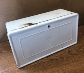
LOT 14: Paper towel holder

All items are being sold in “as-is” condition.