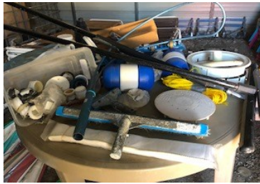
LOT 3: Misc. pool supplies