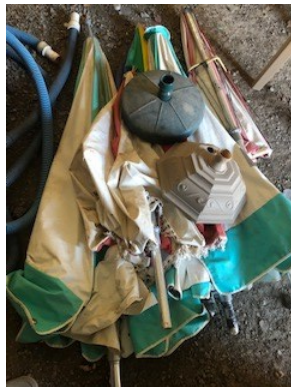
LOT 10: 5 umbrellas with 2 stands.