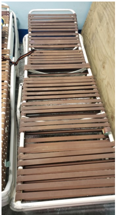
LOT 9: 6 metal and rubber loungers