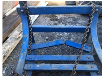
LOT 20: Swing