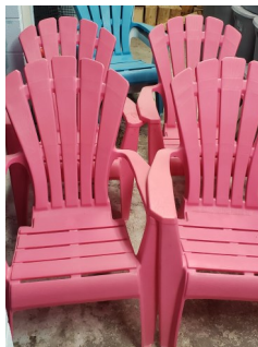
LOT 23: 6 Pink Chairs