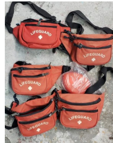
LOT 4: Life Guard Pouches, total of 5.