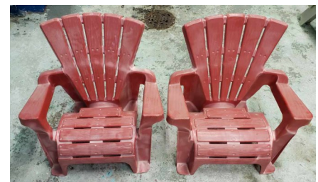
LOT 25: 2 Youth Chairs