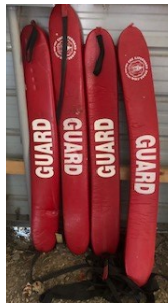
LOT 7: 4 Life Guard belts