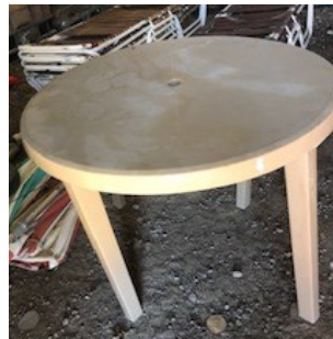
LOT 11: Table