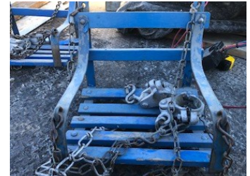
LOT 21: Swing