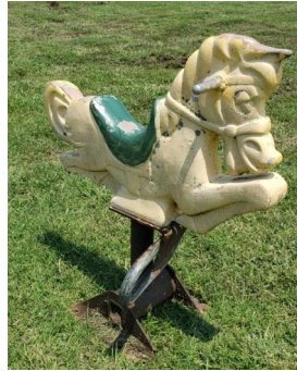
LOT 15: Spring Horse