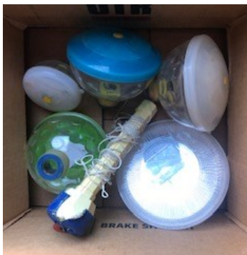
LOT 12: Pool Lights & Thermometer