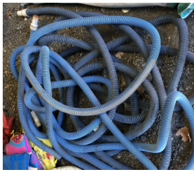
LOT 5: Suction Hose