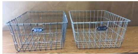
LOT 16: Wire bath-house baskets sold each by basket number