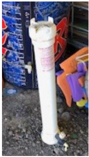
Lot 1: Chlorine Dispenser

The City of Americus is accepting sealed bids on the following lots. The lots may be seen by calling City Hall for an appointment. Sealed bids are due by January 11th , 3:00 p.m. at City Hall, 604 Main Street. Bid forms may be picked up at City Hall or emailed to you by calling City Hall at 620-443-5655. The city reserves the right to refuse any or all bids.